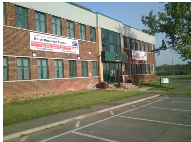
Figure 2 - Bee Hive Centre Skelton