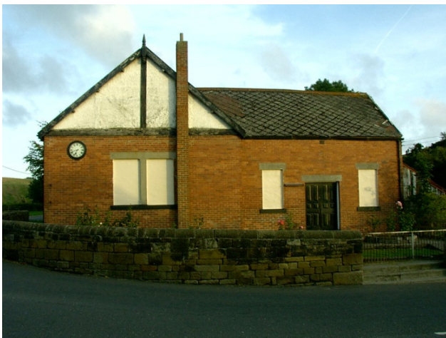
Figure 1 - Miners Institute Boosbeck

The complex has disabled access and includes all the usual facilities with ample parking adjacent, a Bistro and even a Gymnasium.